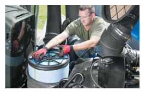
The large and extra-large frame tractors feature a new engine air intake system. The engine air filter has been relocated under the hood for a more efficient air flow and filter life.